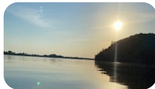
Beautiful Muskrat Lake